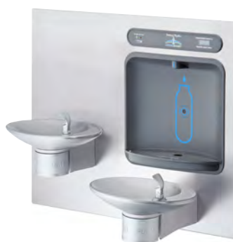
HTHB-OVLSER-I with top panel