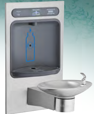
HTHBWF-OVLEBP-I (Non-refrigerated, Filtered)