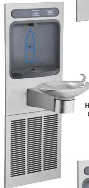
HTHB-OVLER-I (Refrigerated, Non-filtered)