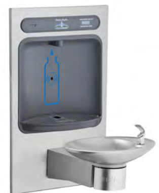
HTHB-OVLEBP-I (Non-refrigerated, Non-filtered)

*A separate unit meeting standing person dimensions required for full ADA compliance.