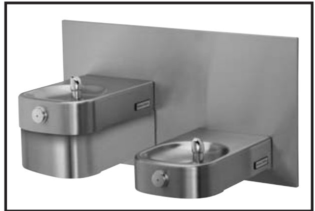
HDF Cane Apron shown installed on Halsey Taylor Model HDFBLEBP