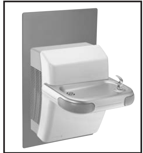
RP-2130 Remodeling Panel shown installed